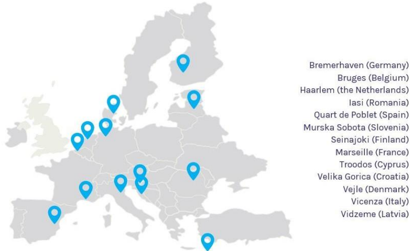
Figure 1 CITIES2030 Living Labs map

prototyping, testing, and scaling up food system innovation and policy. Cities2030 brings together cities and regions across Europe with the aim to sustainably transform their food systems and experiment with new food policies and food innovations. To better describe and manifest the efforts of sustainable CRFS transformations, 10 thematic areas have been identified: production, processing, distribution, markets, consumption, food waste, food security, livelihoods and growth, inclusion and equity, and ecosystem services.